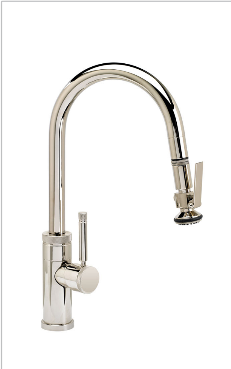
Finish Shown - Polished Nickel