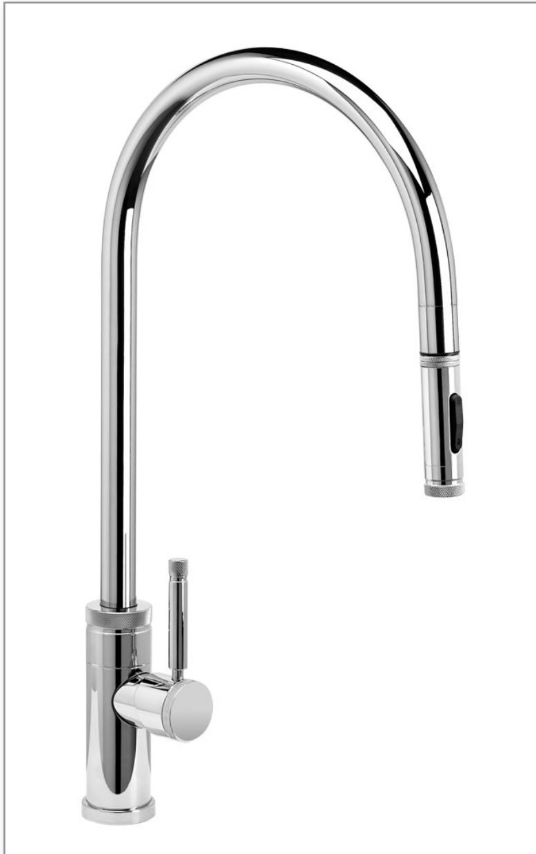
Finish Shown - Chrome