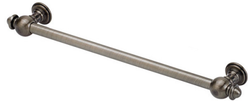
Finish Shown - Antique Pewter