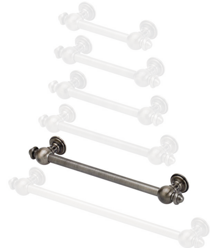
Finish Shown - Antique Pewter

DIMENSIONS MAY VARY AND ARE SUBJECT TO CHANGE. NO RESPONSIBILITY IS ASSUMED FOR USE OF SUPERCEDED OR VOIDED DATA