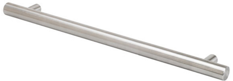
Finish Shown - Stainless Steel

AVAILABLE IN 32 FINISHES + SOLID 316 MARINE GRADE STAINLESS STEEL