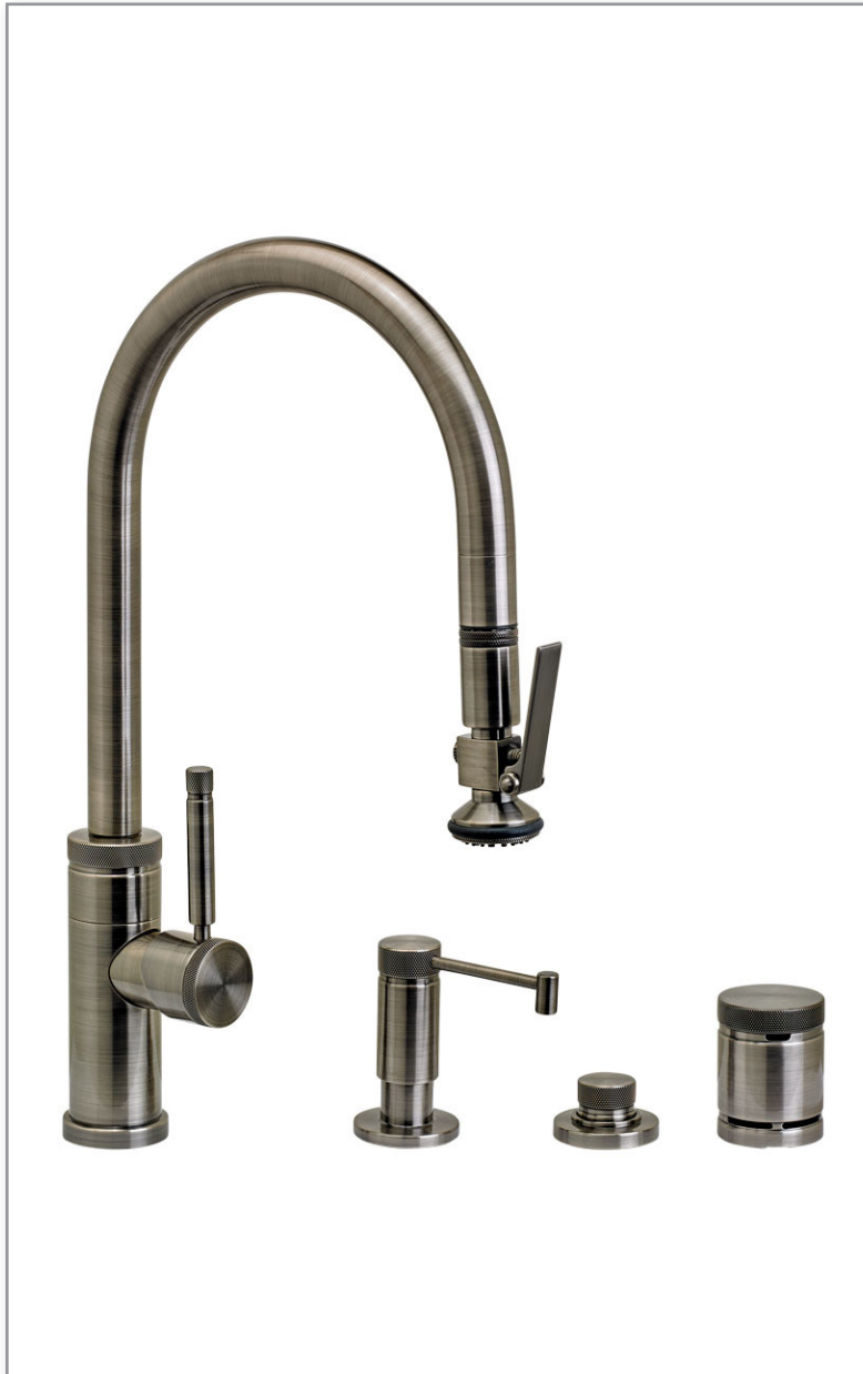
Finish Shown - Antique Pewter