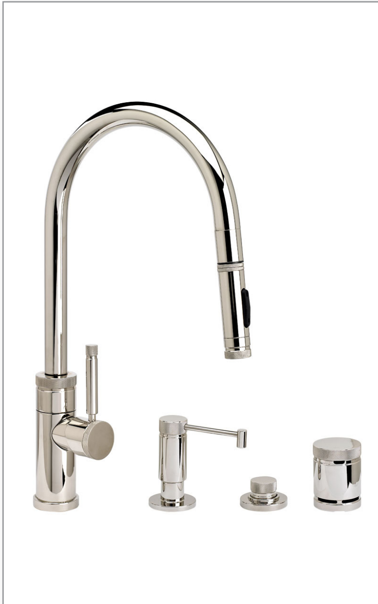
Finish Shown - Polished Nickel