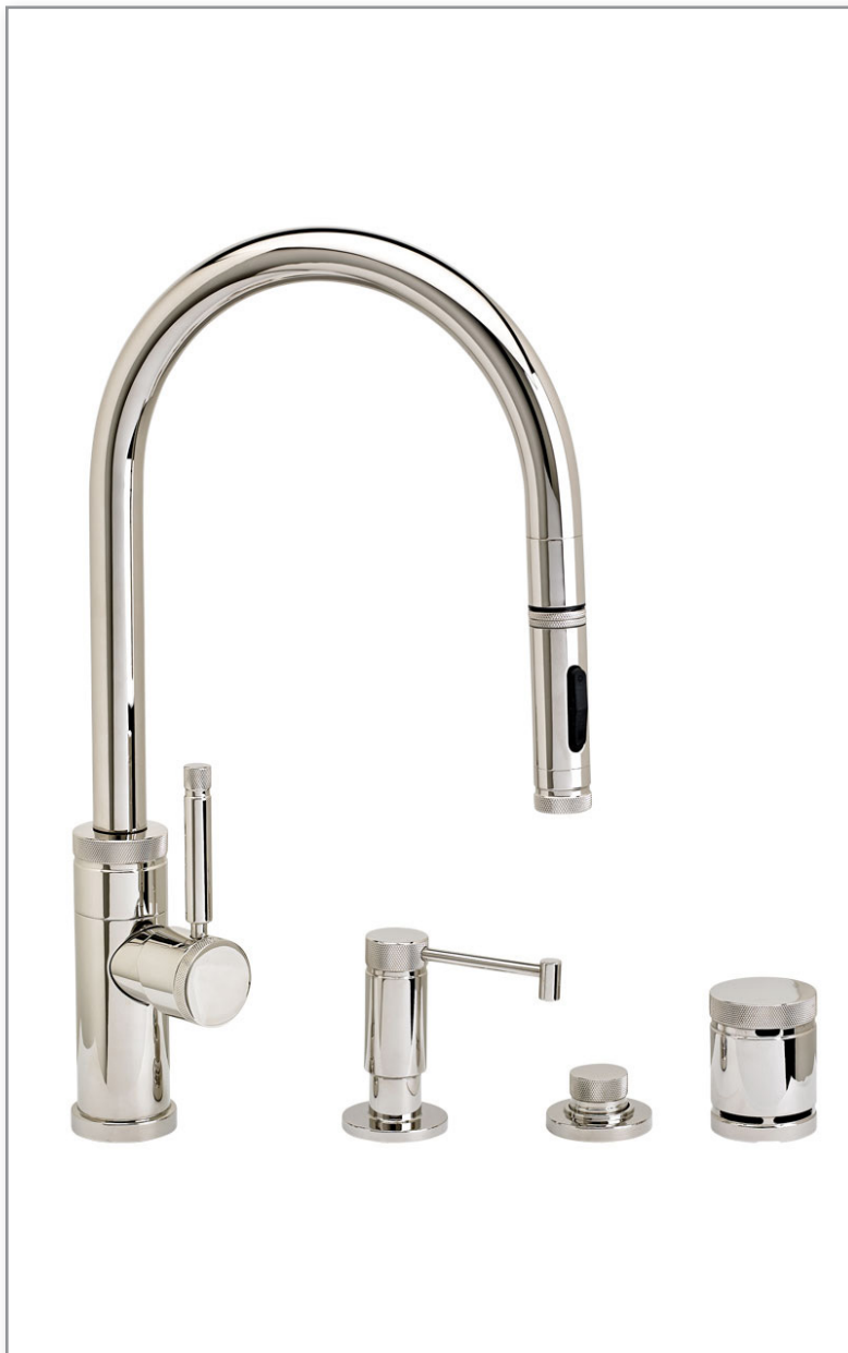
Finish Shown - Polished Nickel