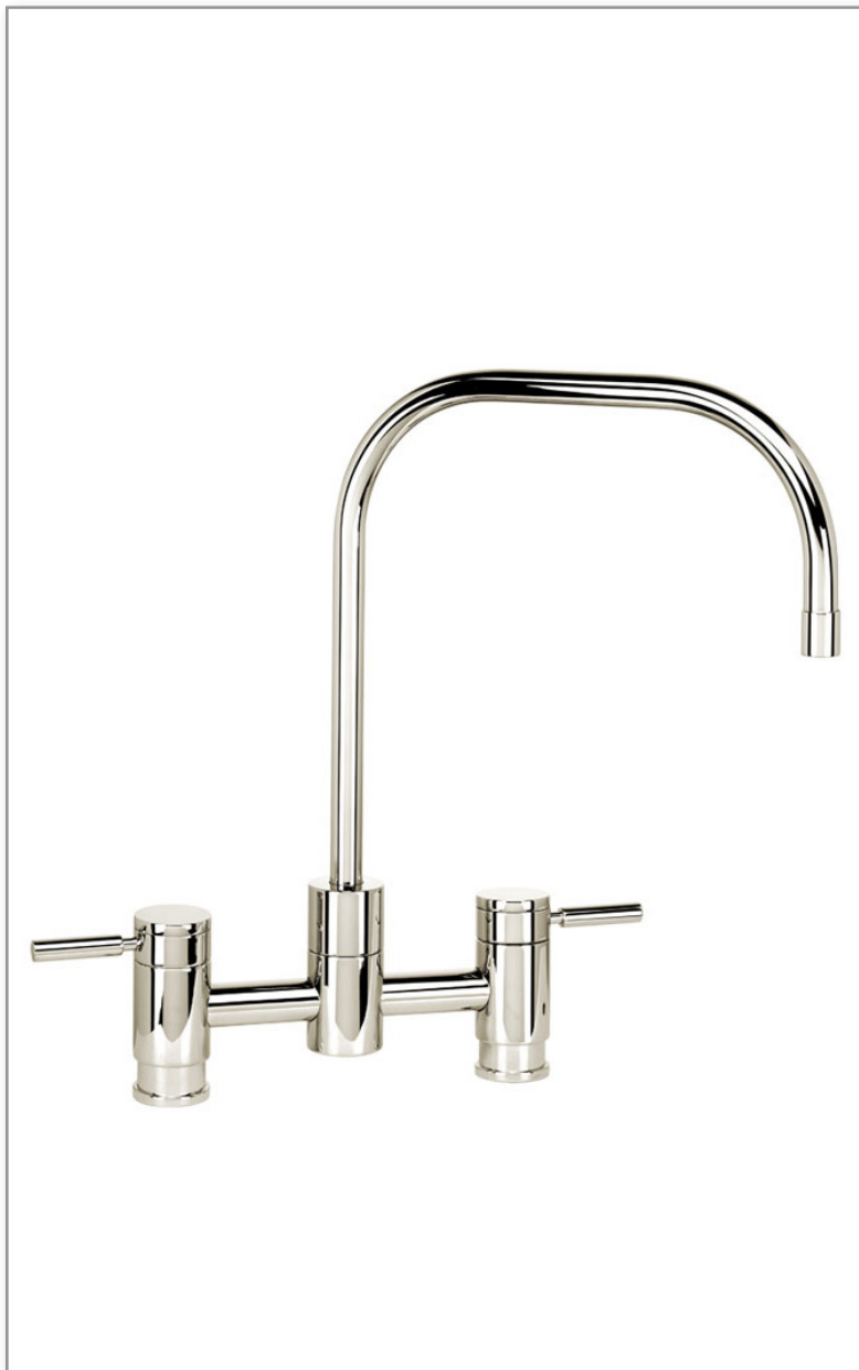
Finish Shown - Polished Nickel