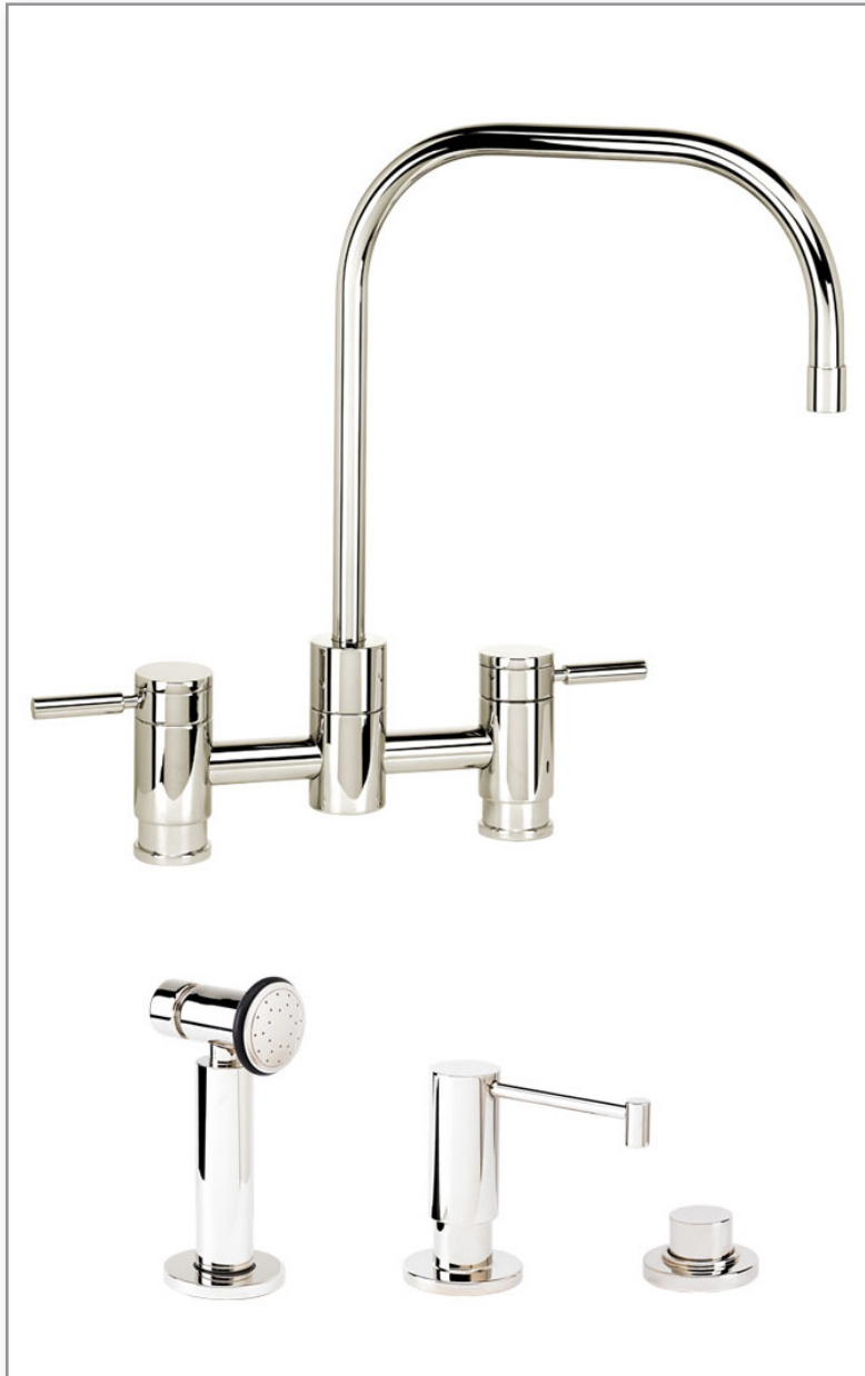
Finish Shown - Polished Nickel