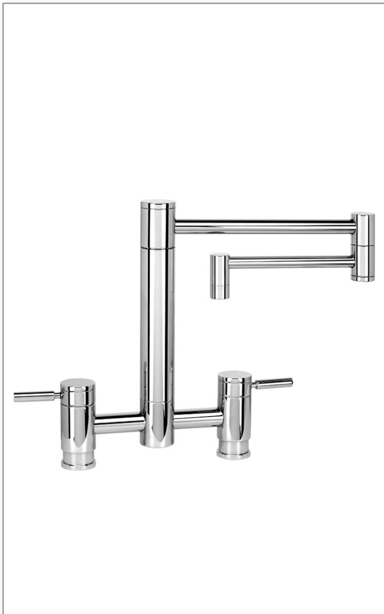
Finish Shown - Chrome