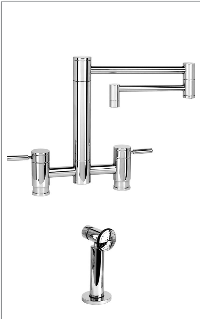
Finish Shown - Chrome