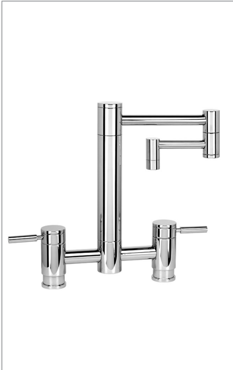
Finish Shown - Chrome