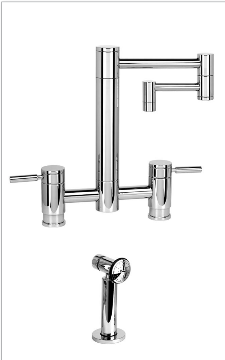
Finish Shown - Chrome