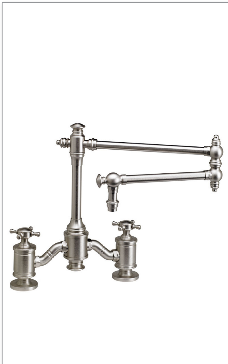
Finish Shown - Satin Nickel