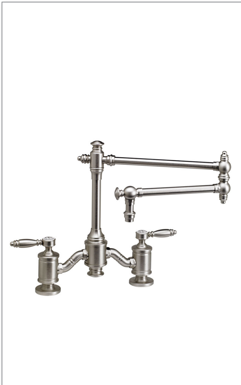
Finish Shown - Satin Nickel