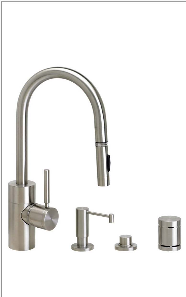
Finish Shown - Stainless Steel