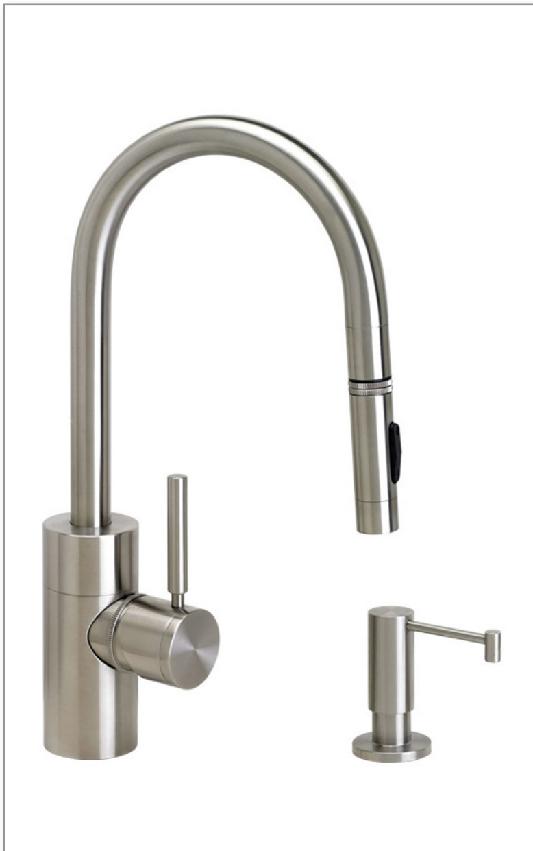
Finish Shown - Stainless Steel