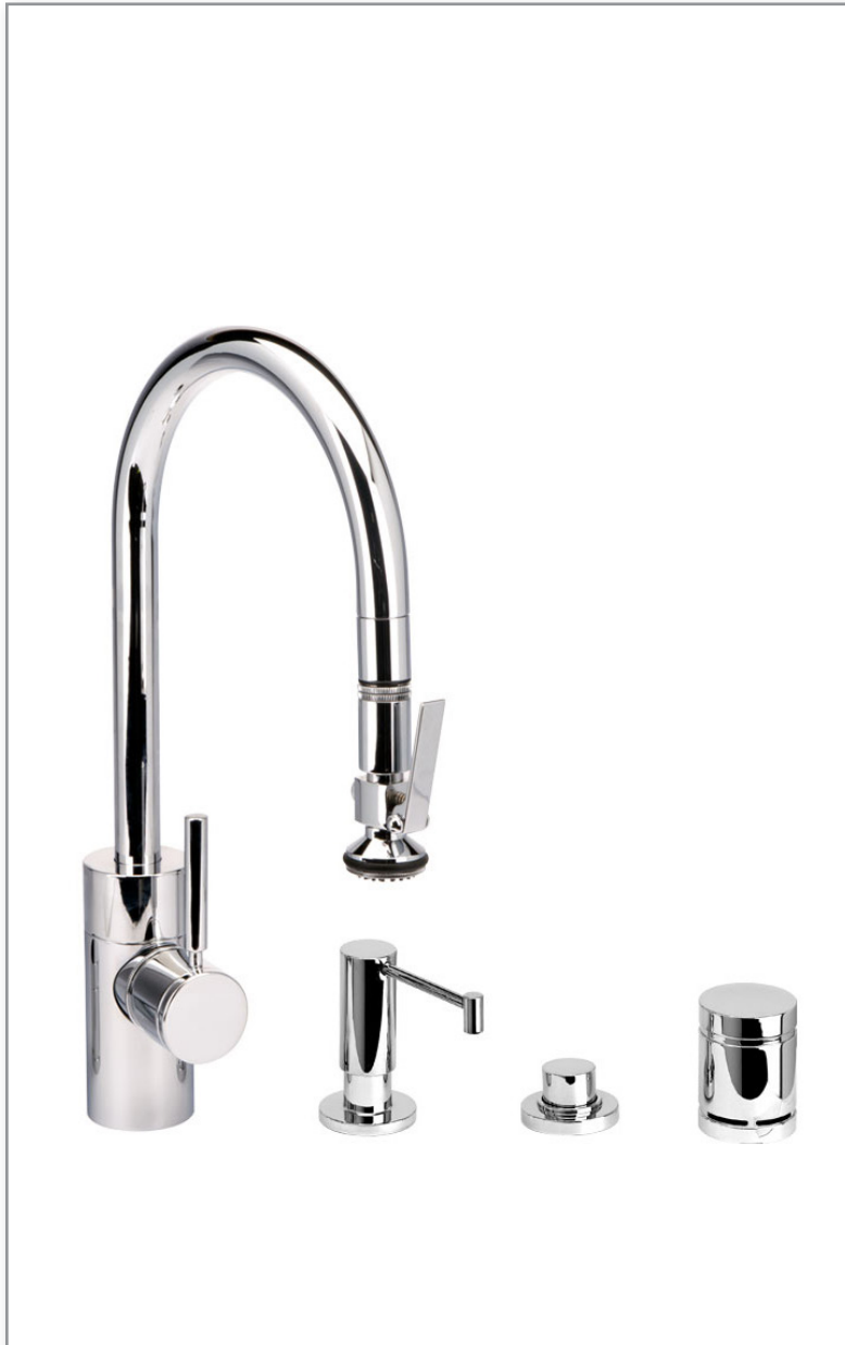
Finish Shown - Chrome