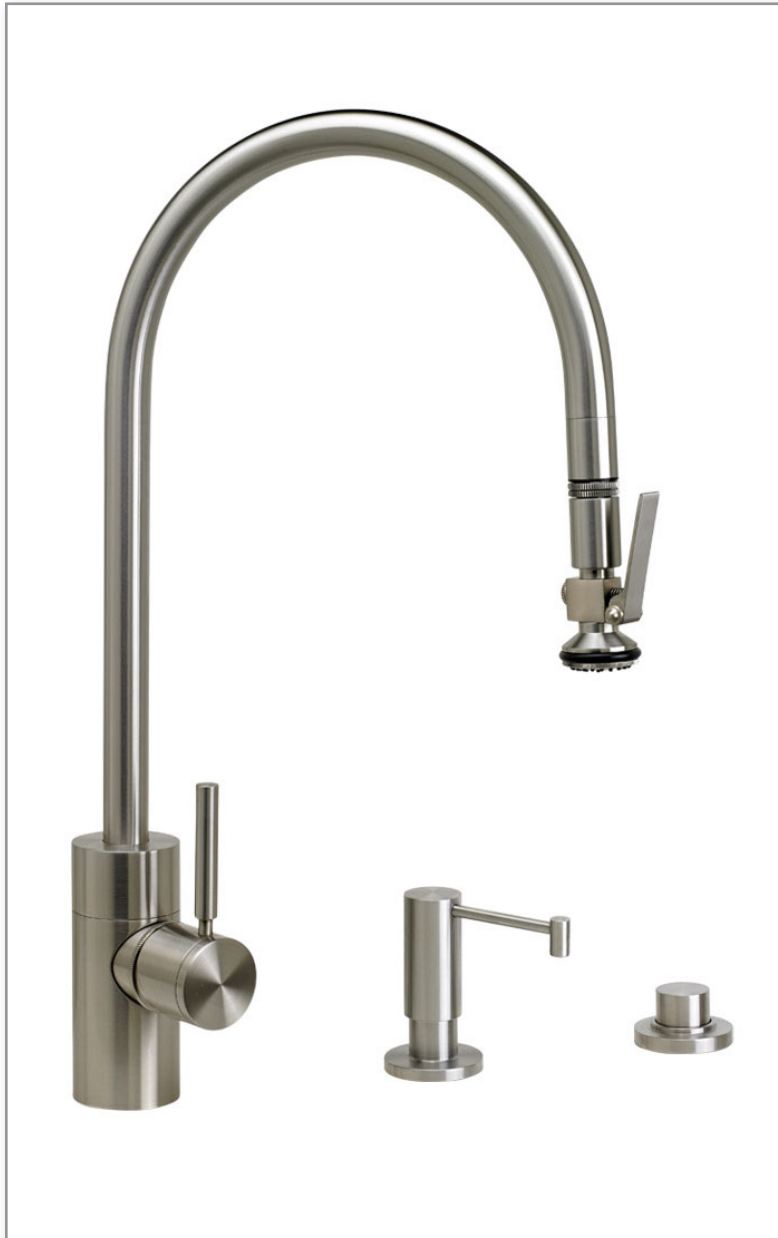
Finish Shown - Stainless Steel