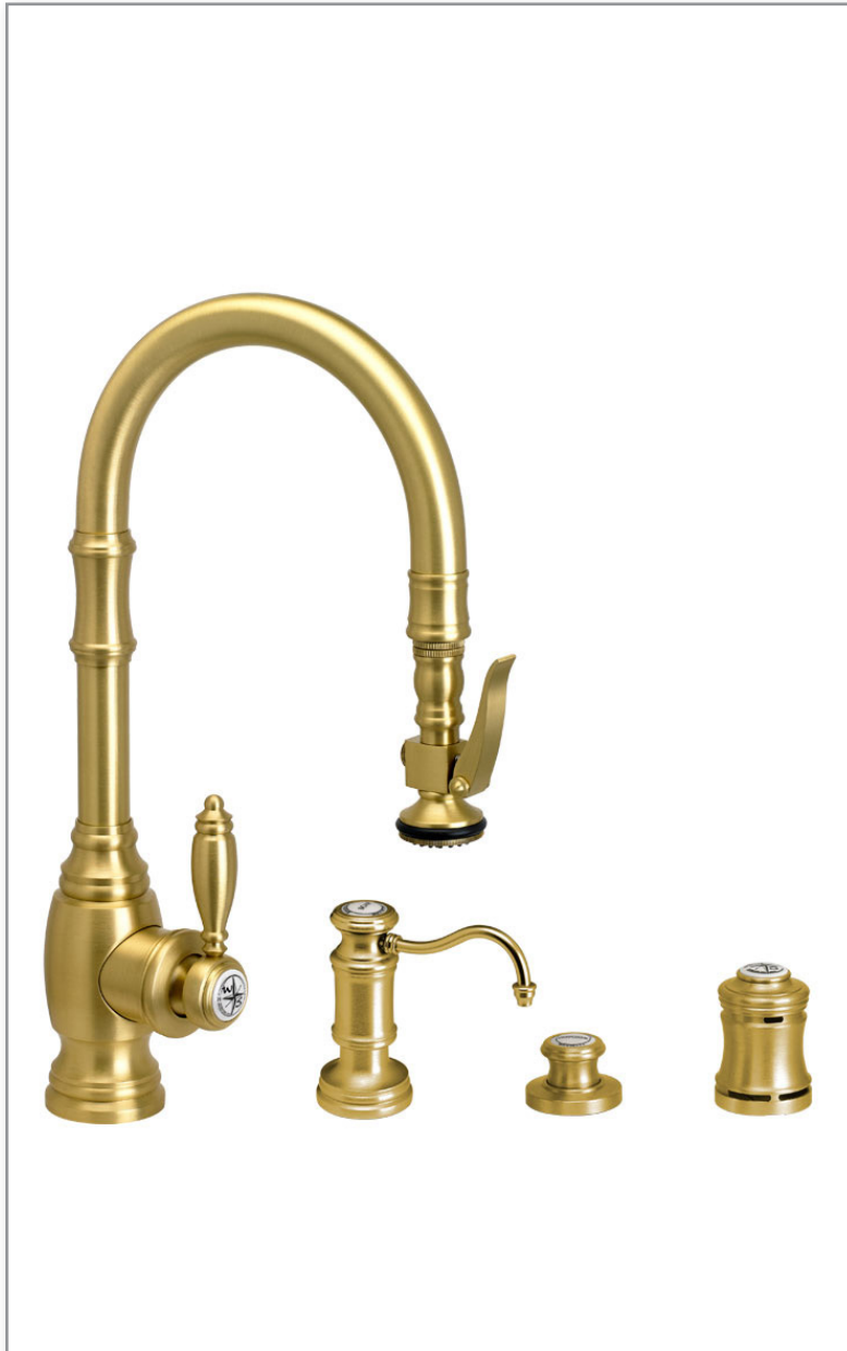
Finish Shown - Satin Brass