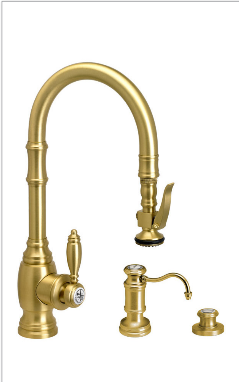
Finish Shown - Satin Brass