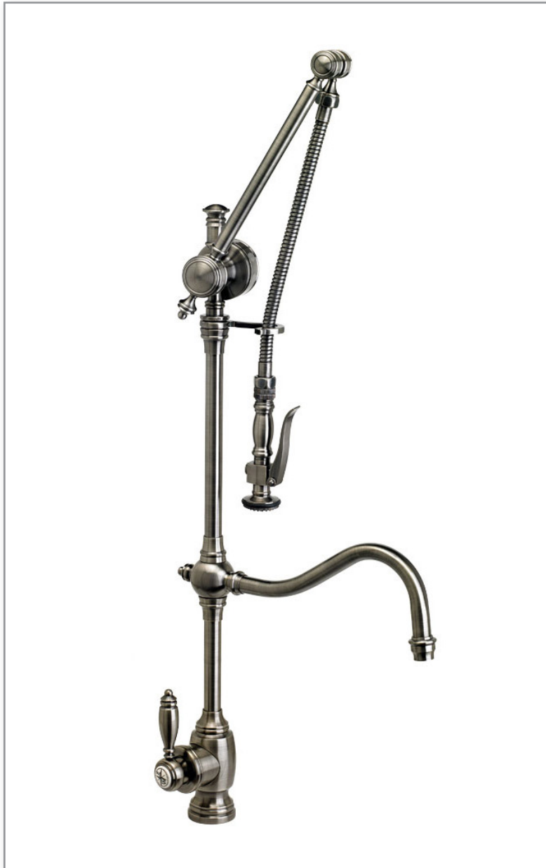
Finish Shown - Antique Pewter