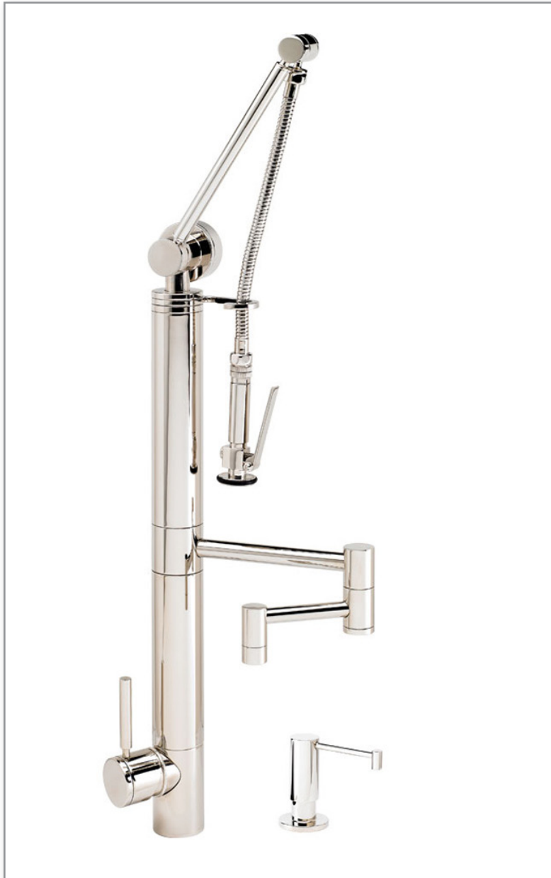
Finish Shown - Polished Nickel