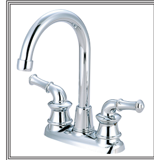
#5DM100 SHOWN * ADA