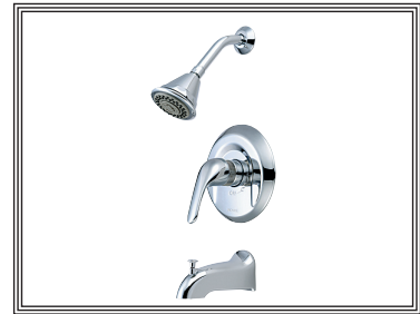
#4LG100T SHOWN * ADA