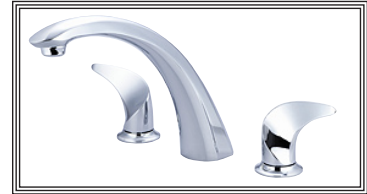
#4CB610T SHOWN * ADA