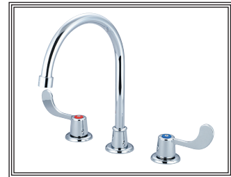
#2LG320 SHOWN * ADA