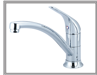
#2LG260H SHOWN * ADA