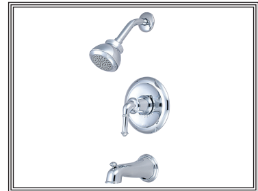
#4DM100T SHOWN * ADA