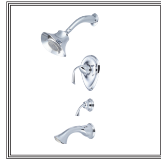
#4CL100T SHOWN * ADA