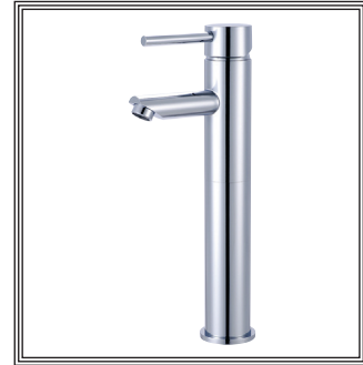
#3MT176 SHOWN * ADA