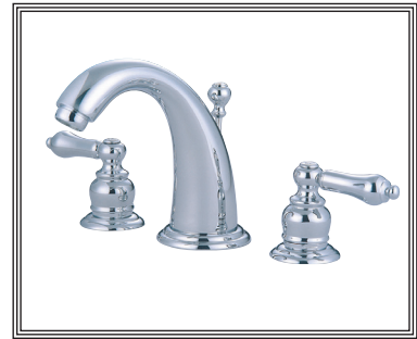
#3BR400 SHOWN * ADA