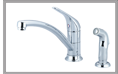
#2LG261H SHOWN * ADA