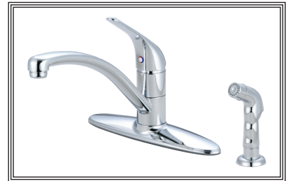
#2LG161H SHOWN * ADA