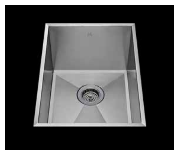
*Flush-Mount Installation Kit is included with each sink *Custom ADA compliant versions are available