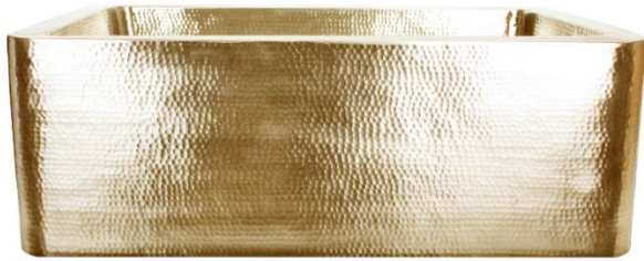
UB Satin Unlacquered Brass