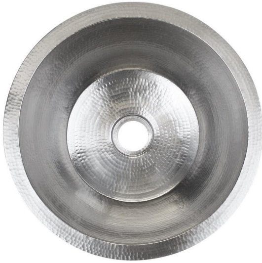
Shown in SS