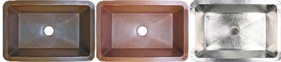
DB Dark Bronze