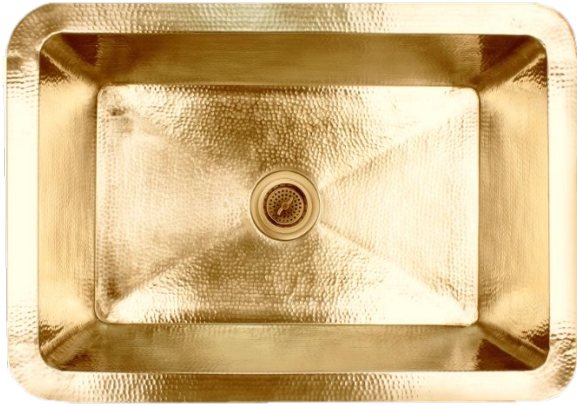
Shown in UB Satin Unlacquered Brass