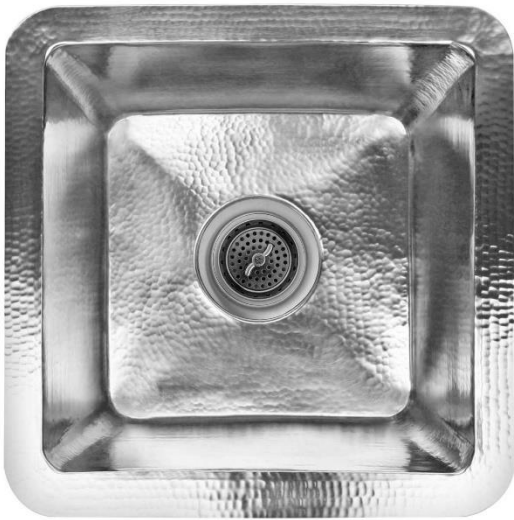
Shown in Satin Stainless Steel