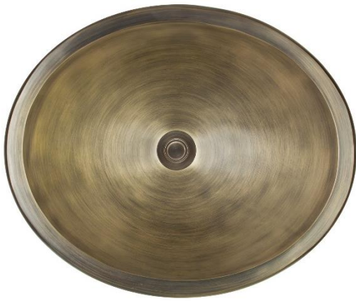
Shown in AB finish