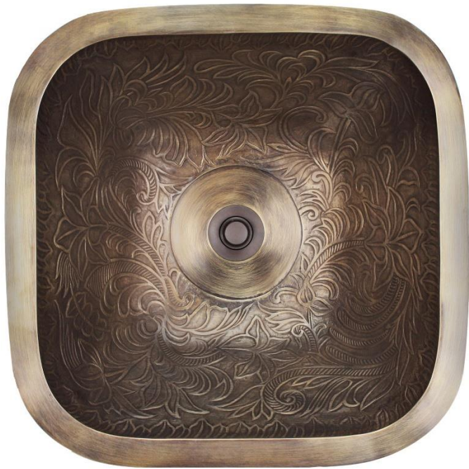
Shown in AB finish