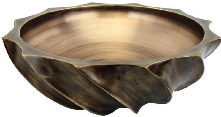
Shown in AB finish