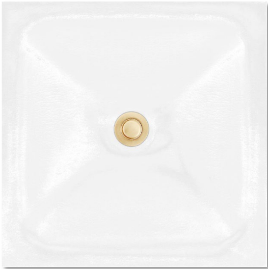
AG17E-01 Shown with D005 UB