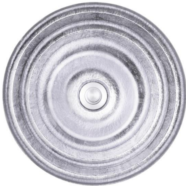
Shown in SLV