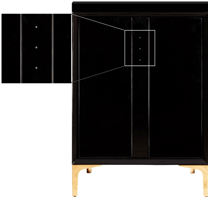
Holes predrilled for easy hardware installation

Vanity Legs and Door Hardware are shipped in a cardboard box inside the Vanity