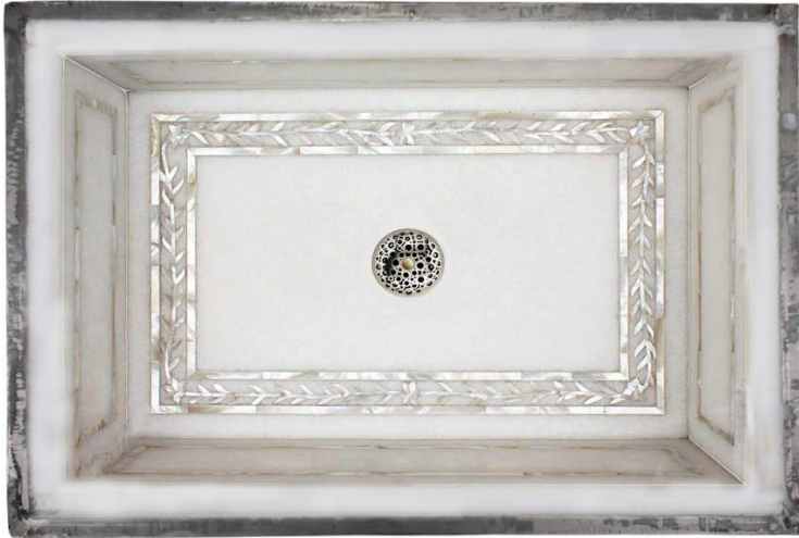
MI10 W shown with D017 PS-SCR02-N drain