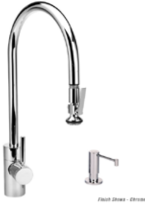
Finish Shows - Chrome