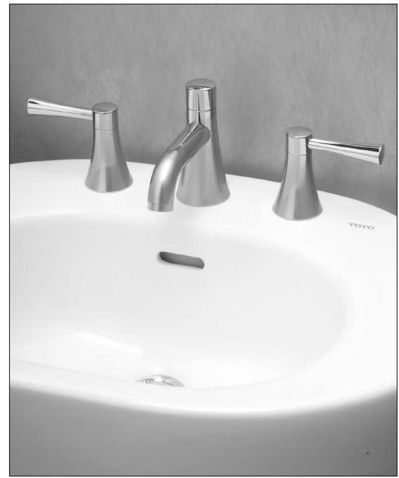
TL794DDL#CP - Nexus® Widespread Lavatory Faucet