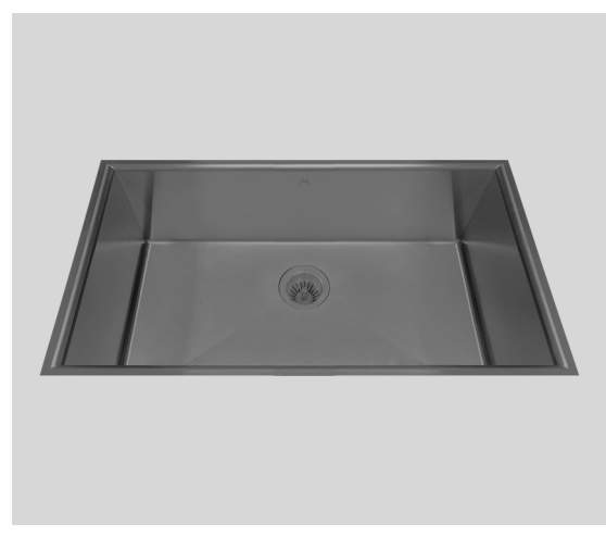
*Flush-Mount Installation Kit is included with each sink *Custom ADA compliant versions are available